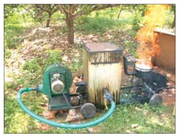
Cashew shell cake-based up draft gasifier

A cashew shell cake-based draft gasifier suitable for applications needing thermal requirement of 10–12 kW was developed. Various parameters influencing gasification process were analyzed and average flame temperature of gas generated was found to be 487°C.