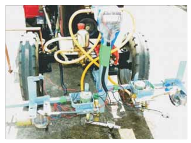
Colour sensor-based site-specific herbicide applicator

A two-row tractor-mounted inter-row site-specific herbicide applicator was developed in which laser sensor