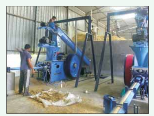
Briquetting plant for agro-residues

With technical guidance of the Central Institute of Agricultural Engineering, Bhopal, Shri Ajay Gandhi has successfully established a biomass briquetting plant (500 kg/h capacity) at Mandideep, Bhopal district. This plant produces 3,000 kg briquettes per day using agroresidues such as soybean straw, pigeonpea stalk, Lantana camara stalk and other woody weeds and sells them to local industries for utilization as fuel for thermal applications in boilers an agro-industries, brick kiln etc. The energy consumption in briquetting has been estimated to be 0.1 kWh/kg. Market price of biomass briquettes is ₹ 4/kg, whereas total expenditure for producing the briquettes works out to ₹ 3/kg. Thus it is possible to earn about ₹ 60,000/month by operating the plant for 6-7 h/day for 20-22 days/month. This activity permits farmers of nearby villages to gain additional income from biomass, which was otherwise being burnt in the field.