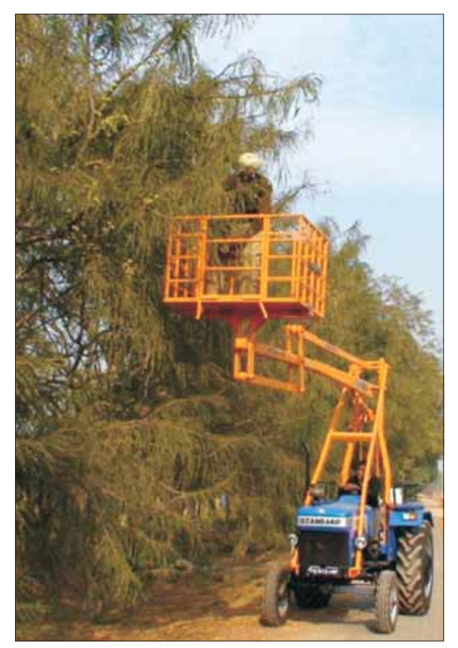
Tractor-mounted pick positioner for fruit harvesting and pruning

A tractor-mounted pick positioner having a movable platform fitted on a tractor, with double acting hydraulic cylinder, was developed in which a person can reach to a height of 9.6 m for harvesting fruits and pruning trees.